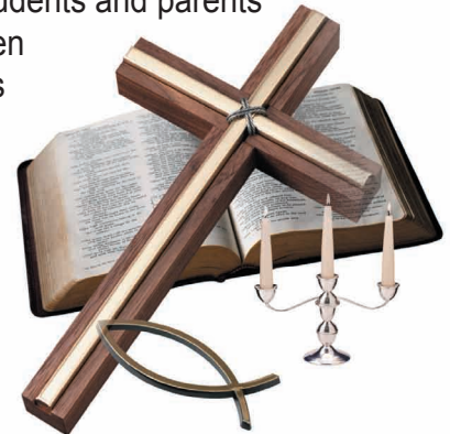
WORSHIP SERVICE FOR STUDENTS