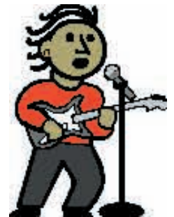
MUSIC & DANCING ON THE GREEN: LEGENDS OF MOTOWN