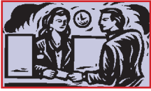
FIRST-YEAR EXPERIENCE REGISTRATION