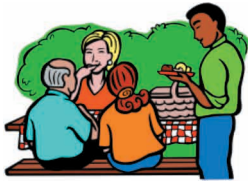
DINNER ON CAMPUS GREEN